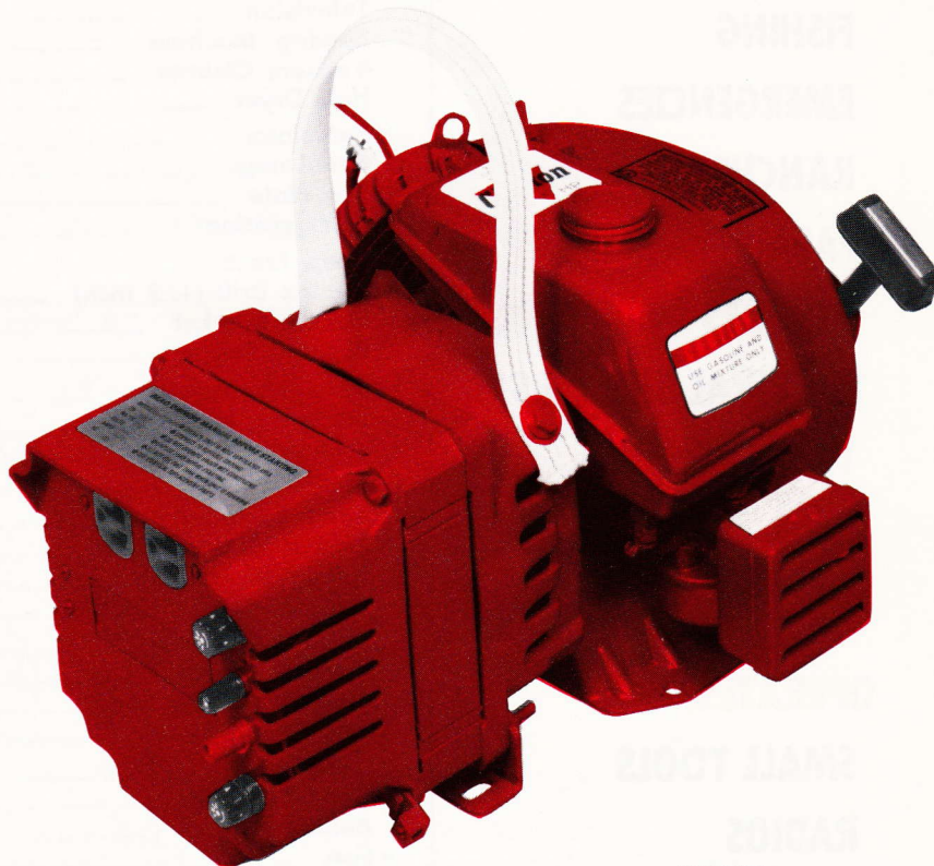
MODEL 500 - 750W